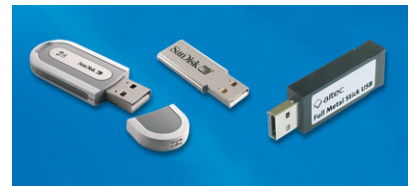
USB Stick CopyStation is compatible with USB 1.1 and 2.0 sticks.